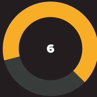
Issues per year